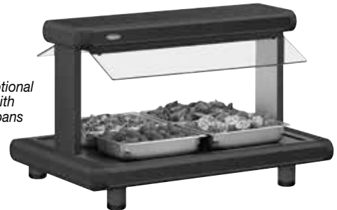
GR2BW-30 in optional Designer color with accessory food pans