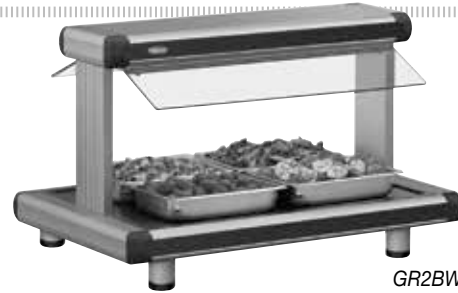
GR2BW-30 with accessory food pans