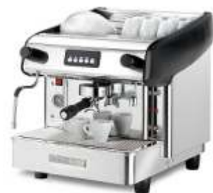
mini control 1 Gr