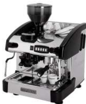
Mini Control I GR with grinder