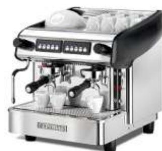
mini control 2 Gr

the machines with a display are also equipped with an advanced pid sensor system so that the water always keeps an exact brewing temperature. the temperature is continuously monitored and is rapidly adjusted if it changes. this means that the temperature can be adjusted for the very best espresso experience.