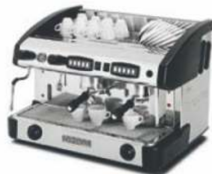
Control 2 GR