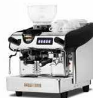
mini control 1 Gr with grinder, black