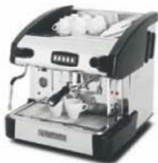
Mini Control I GR