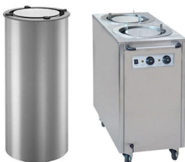
Plate & Cup Warmer