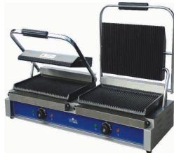
Table Top Griddle